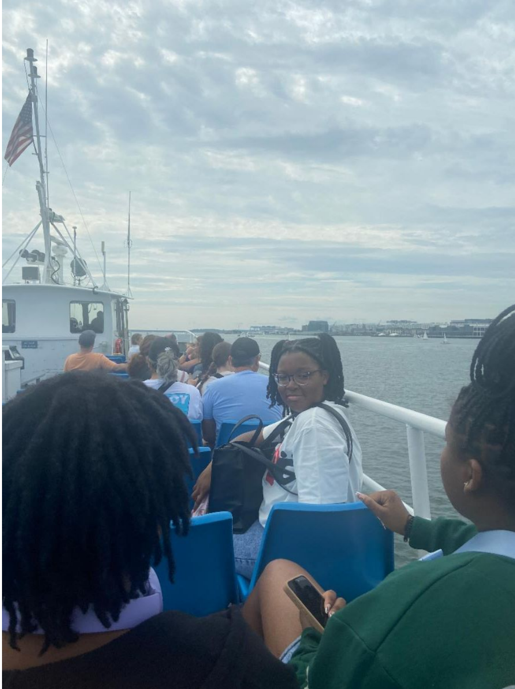
RYP students head out on a tour of Boston Harbor

The students in this year's RYP summer youth program have had opportunities to both learn - and have fun - together.