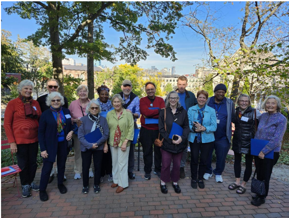
Members of the First Parish in Lincoln congregation visiting UUUM's campus