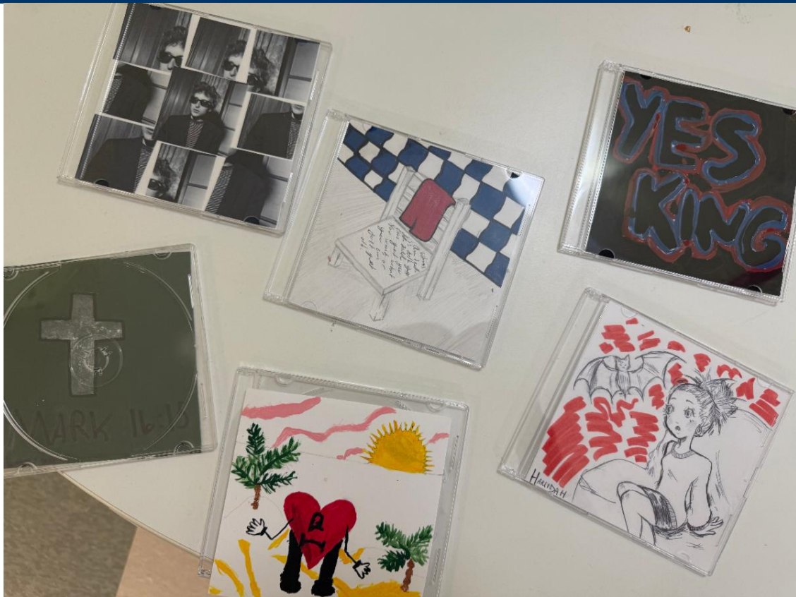
CD album covers created by the students in RYP during a recent workshop about self expression